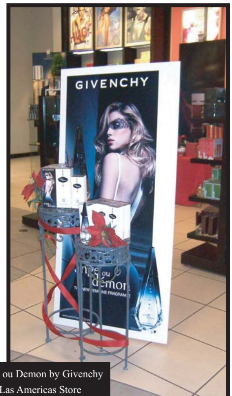
Ange ou Demon by Givenchy Las Americas Store