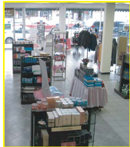
Eagles Pass, TX Store