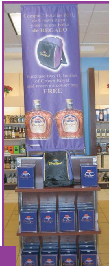
Crown Royal Brownsville Store