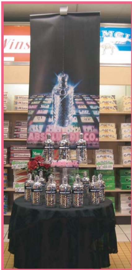
Absolut Disco Trolley Store

For several years now Baja has been working closely with suppliers on various promotional programs. We greatly appreciate your continued support. Thank you!